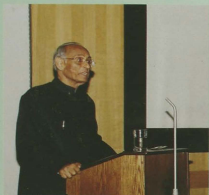
Mr. L. M. Singhvi, President of WJC addressing the gathering