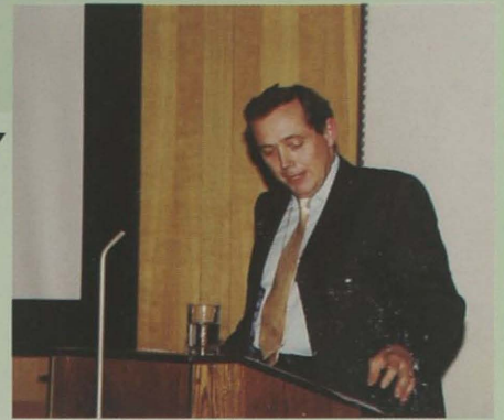
Mr. Peter Luff, conservative MP delivering his speech at the function