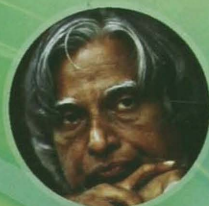
The President Mr. A. P. J. Abdul Kalam Apostle of Ahimsa & Peace